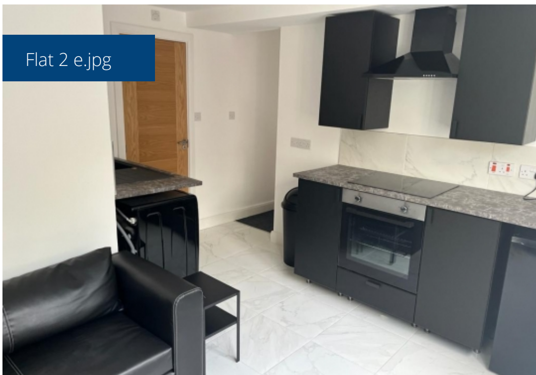
Flat 2 e.jpg